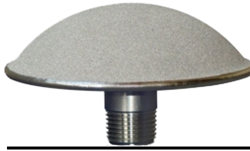
Fig. 2: Titanium Dome Diffusor

These fine Ozone bubbles are produced using, specially designed Titanium dome diffusor for the Ozone application, refer Fig.2. Dome diffusor mechanically produces possible finest bubbles/ The Ozone gas when passes through the micro porous holes, over the period of time increased the pore size. Eventually increasing the bubble size & reducing the Ozone gas transfer efficiency.